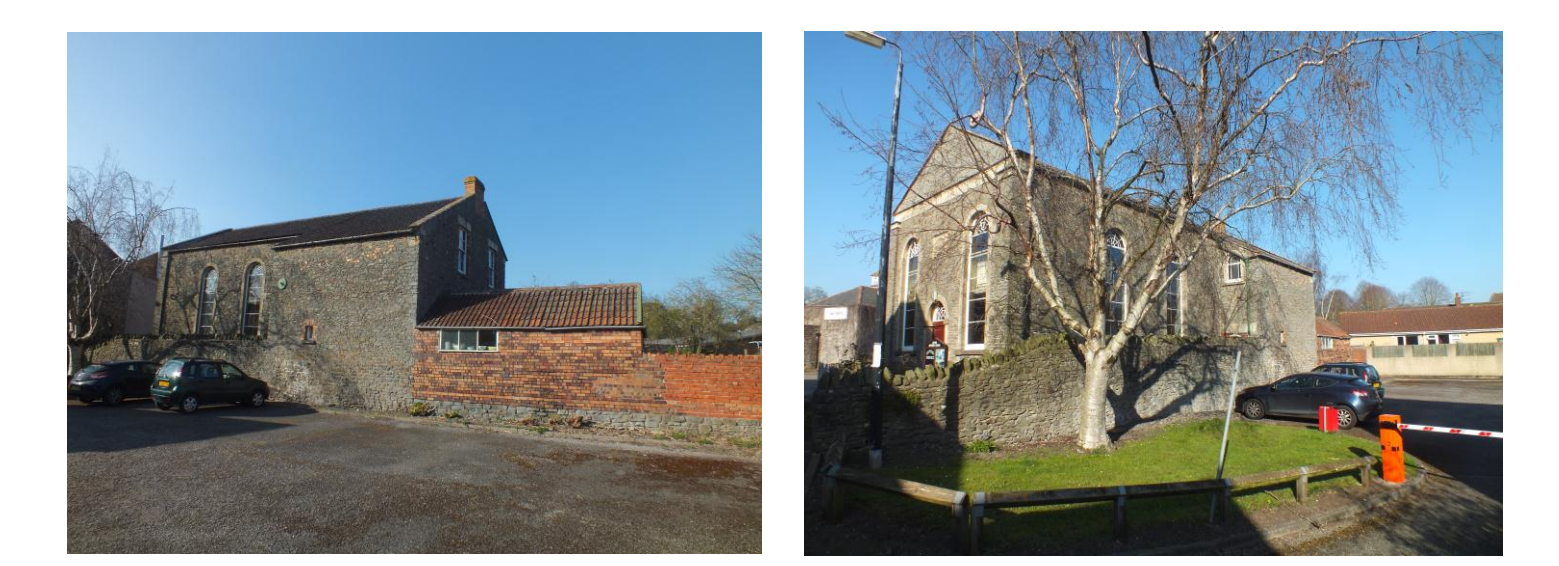
Disclaimer: These particulars should not be relied upon as statement or representation of fact and do not constitute part of an offer or contract. The seller does not make or give, nor do we or our employees have the authority to make or give any representation or warranty in relation to this property. We would strongly recommend that all the information we provide about the property is verified by yourself on inspection. We have not carried out a survey nor have we tested any appliances, services or specific fittings at the property. Room sizes should not be relied upon for carpets and the floor plan is intended as a guide only. Measurements, windows/doors and other items within the floor plan are approximate and may not necessarily be to scale. In addition photography, either internal or external may have been taken with the use of a wide angled lens.

P593 Printed by Ravensworth 01670 713330